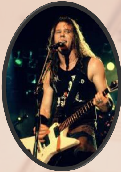
James Hetfield: rhythm guitarist/ vocalist of Metallica