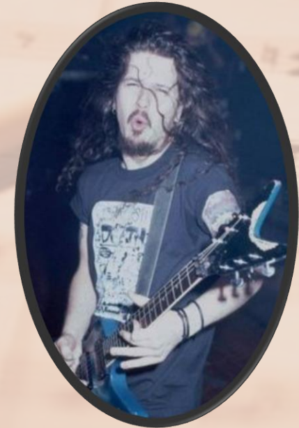
Darrell Abbott: guitarist of Pantera