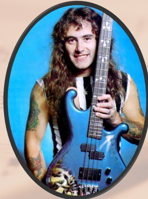
Steve Harris: bassist of Iron Maiden